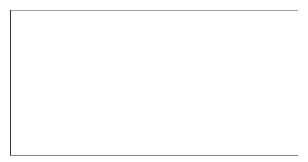
Figure A.2: Additional basic control-flow patterns

WHILES because REPEAT resolves one THEN . As above, if the user finds this count mismatch undesirable, REPEAT could be replaced in-line by its own definition.